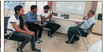
Interview role play