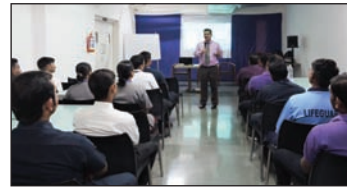
Employee Skill Development Programme