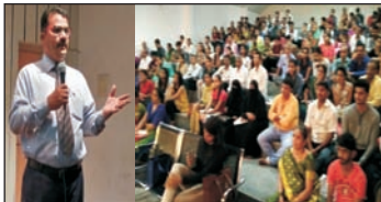
"Plan Career in Pharma Sales & Marketing"