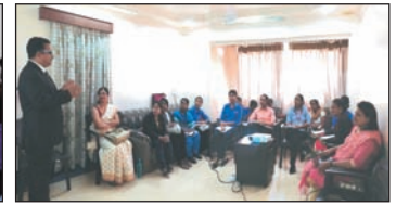
Front Desk Executive-Receptionist Workshop