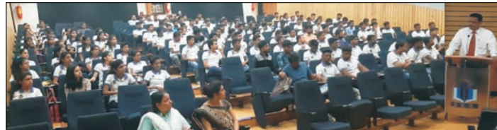
"Pre Placement Preparation" Workshop